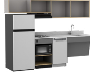
X-222ACCL-U, X-222ACCL-BOPT, X-222ACCL-STN ACC KITCHENETTE W/DISHWASHER (LEFT) 100"W X 24.5"D X 74"H