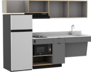
X-222ACCL-U, X-222ACCL-B, X-222ACCL-STN ACC KITCHENETTE (LEFT) 100"W X 24.5"D X 74"H