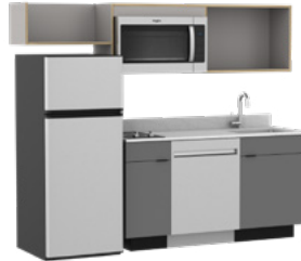
X-222L-U, X-222L-BOPT, X-222L-STN KITCHENETTE W/DISHWASHER (LEFT) 90"W X 24.5"D X 74"H