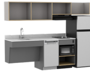
X-222ACCR-U, X-222ACCR-BOPT, X-222ACCR-STN ACC KITCHENETTE W/DISHWASHER (RIGHT) 100"W X 24.5"D X 74"H