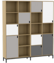
LM-234 DELIVERY CUBBIES 81.25"W X 15"D X 92"H

Our consumer warranty is our promise to you, the purchaser, that each piece of our furniture is warranted against defects in materials and workmanship {under normal use} for a period of {5} years from the date of delivery.