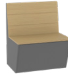
LM-206 VENDING BOOTH SEATING 30.75"W X 24.5"D X 36.5"H