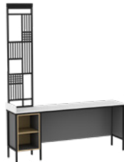
X-220, X-220-STN, X-220.1-SCRN ISLAND DESK 82"W X 18"D X 106.25"H