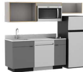
X-222R-U, X-222R-BOPT, X-222R-STN KITCHENETTE W/DISHWASHER (RIGHT) 90"W X 24.5"D X 74"H