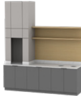
LM-235 HYDRATION STATION 96"W X 30.75"D X 114"H