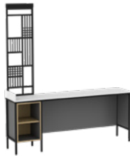
X-220, X-220-STN, X-220-SCRN ISLAND DESK 82"W X 18"D X 94.25"H