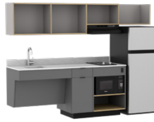
X-222ACCR-U, X-222ACCR-B, X-222ACCR-STN ACC KITCHENETTE (RIGHT) 100"W X 24.5"D X 74"H