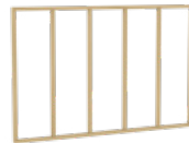
LM-236 SLAT WALL 125.75"W X 3"D X 82"H