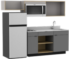
X-222L-U, X-222L-B, X-222L-STN KITCHENETTE (LEFT) 90"W X 24.5"D X 74"H