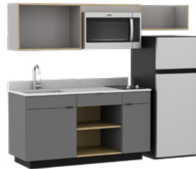
X-222R-U, X-222R-B, X-222R-STN KITCHENETTE (RIGHT) 90"W X 24.5"D X 74"H