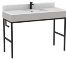
X-223-ACC ACC VANITY 48"W X 20"D X 38"H