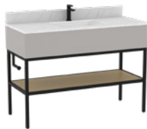
X-223 STANDARD VANITY 48"W X 20"D X 38"H