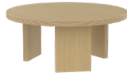
LM-231 COFFEE TABLE 36"W X 36"D X 16"H