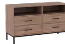
X-297 DRESSER 60"W X 22"D X 34"H